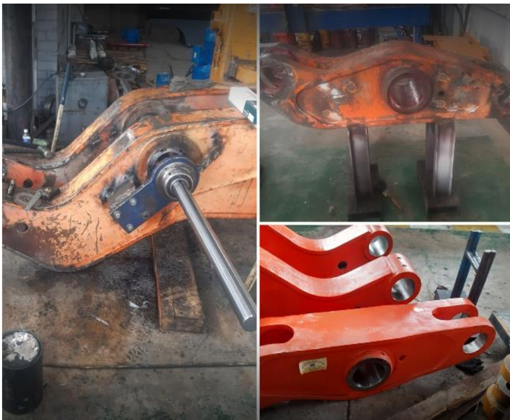
Fig B – Before and after scenarios on an LHD H Frame and Swing Lever