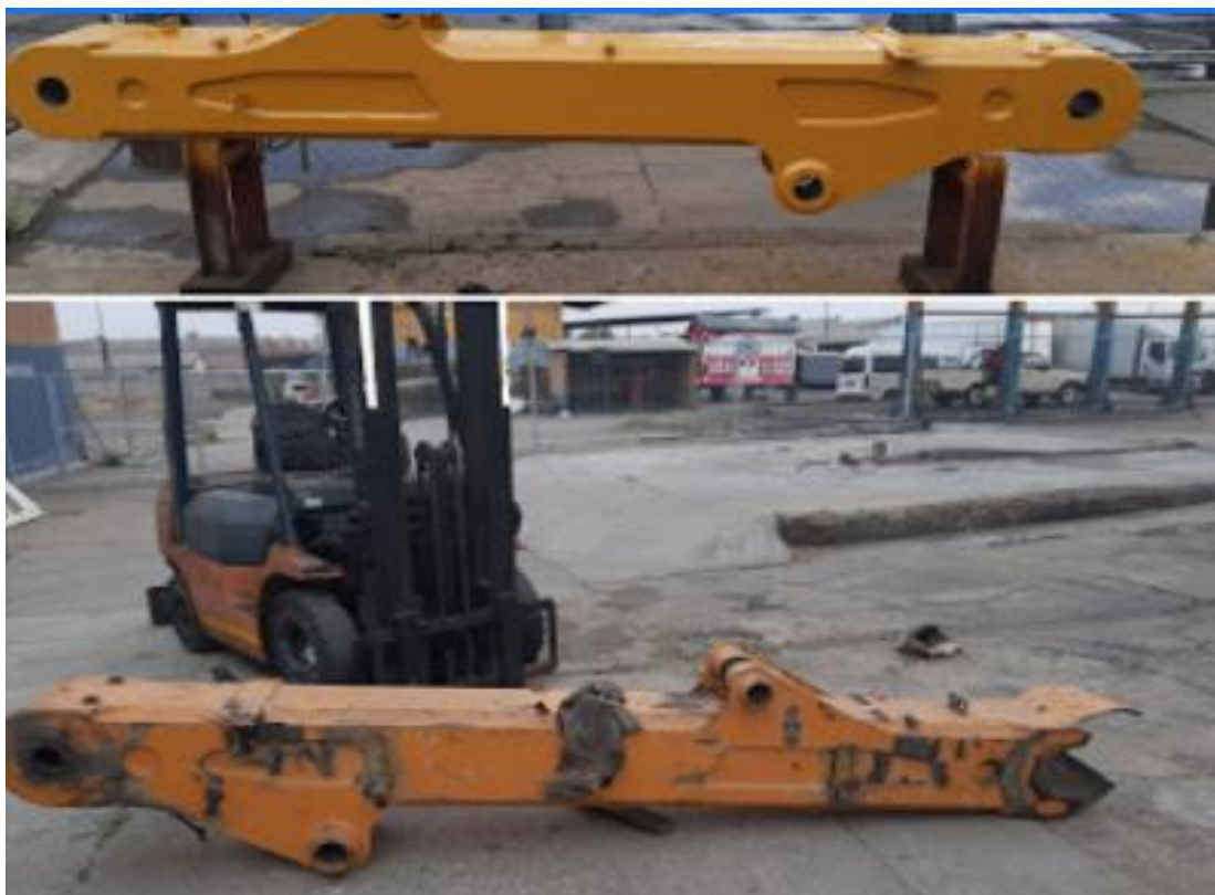
Fig F- Before and After on a Rock breaker Boom