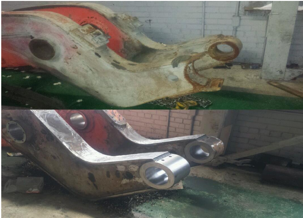
Fig A- Before and After Scenarios on a H Frame