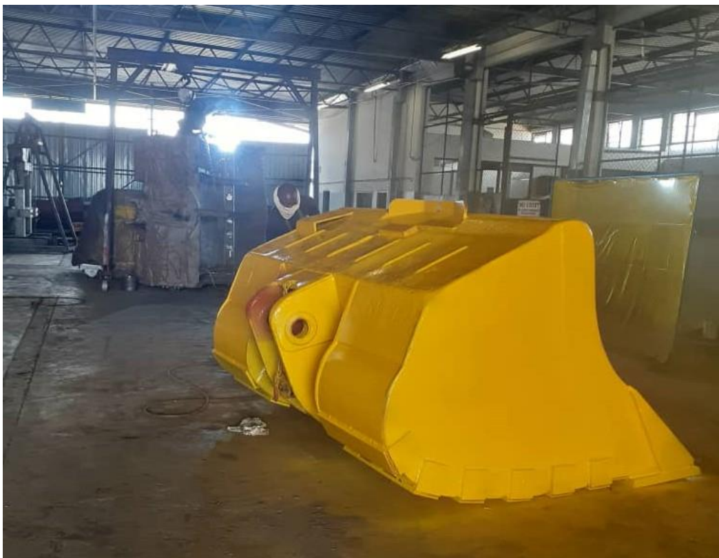
Fig D- Before and after scenarios on a bucket