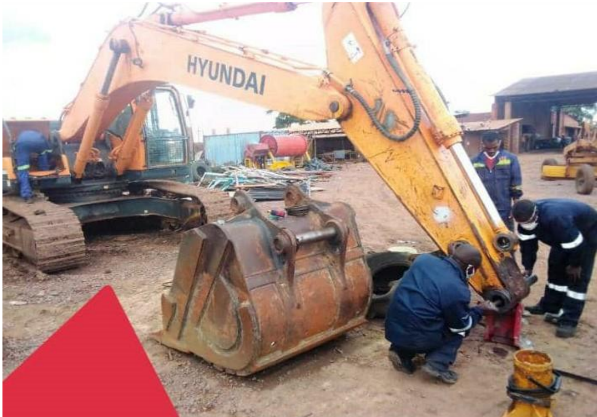
Fig E- Site Installations and Rectifications